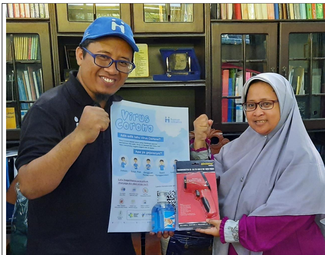
Provision of Posters, Hand Sanitizers and Body Temperature Measuring Devices to the School Principal