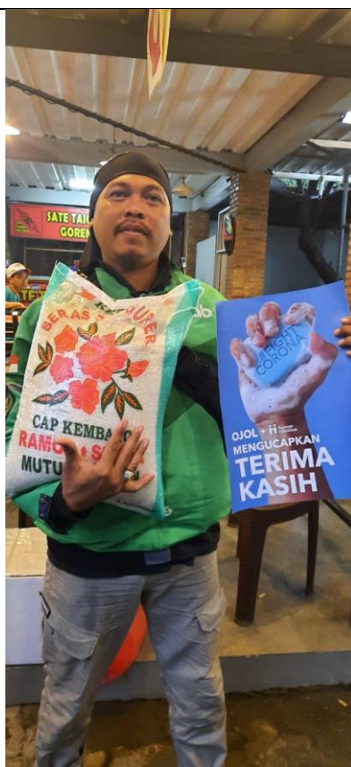
Food distribution for online motorcycle taxi drivers