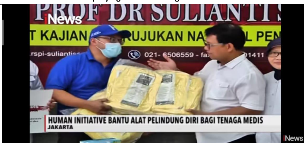
Provision of PPE for health workers in RSPI Sulianti Saroso, Jakarta