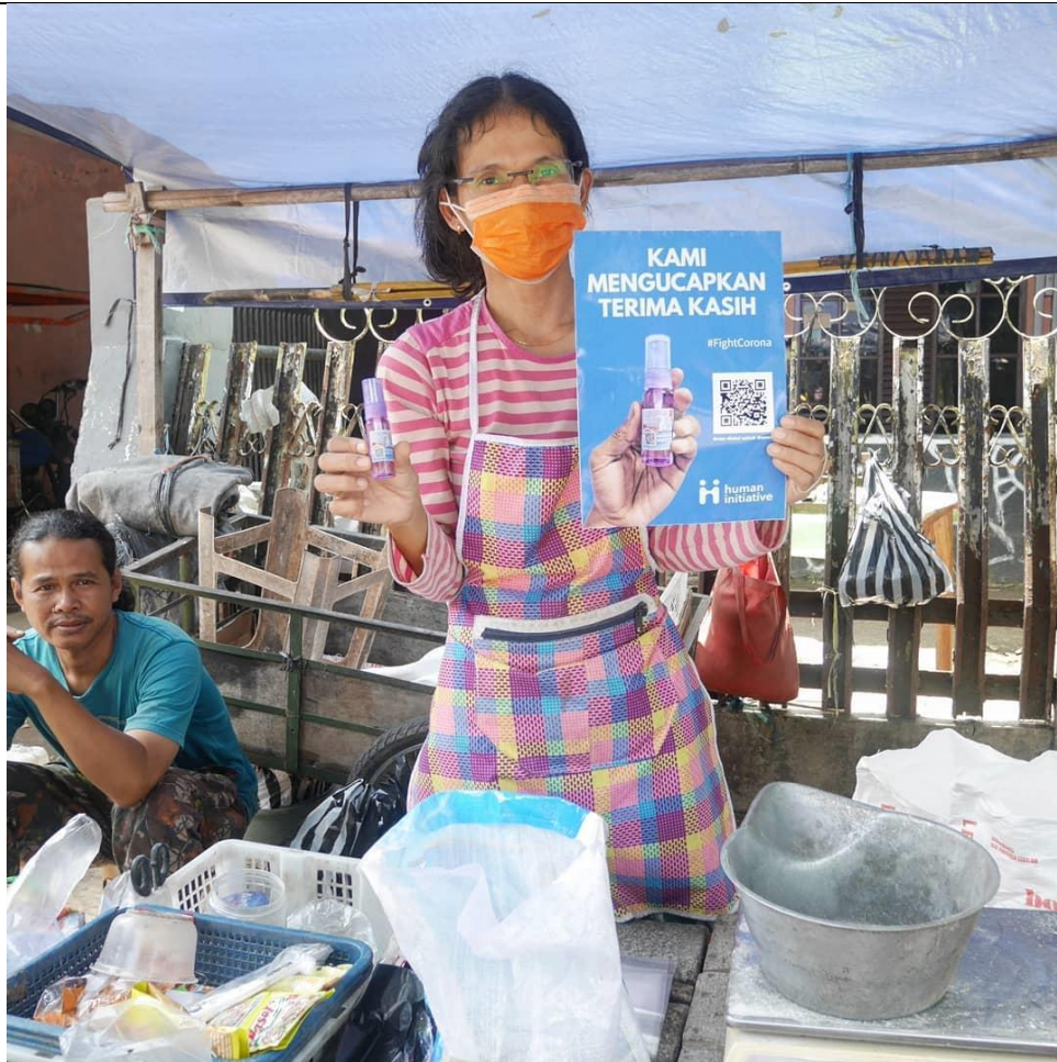
Hand sanitizer distribution for street vendors in Bandung