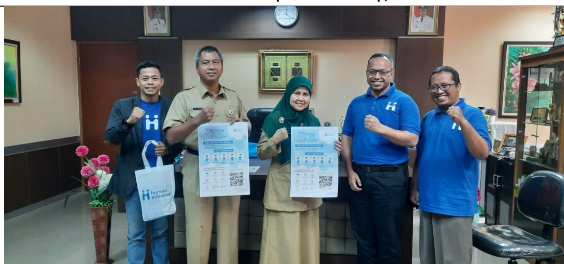
Educational Poster about COVID-19 to Health Office of Depok