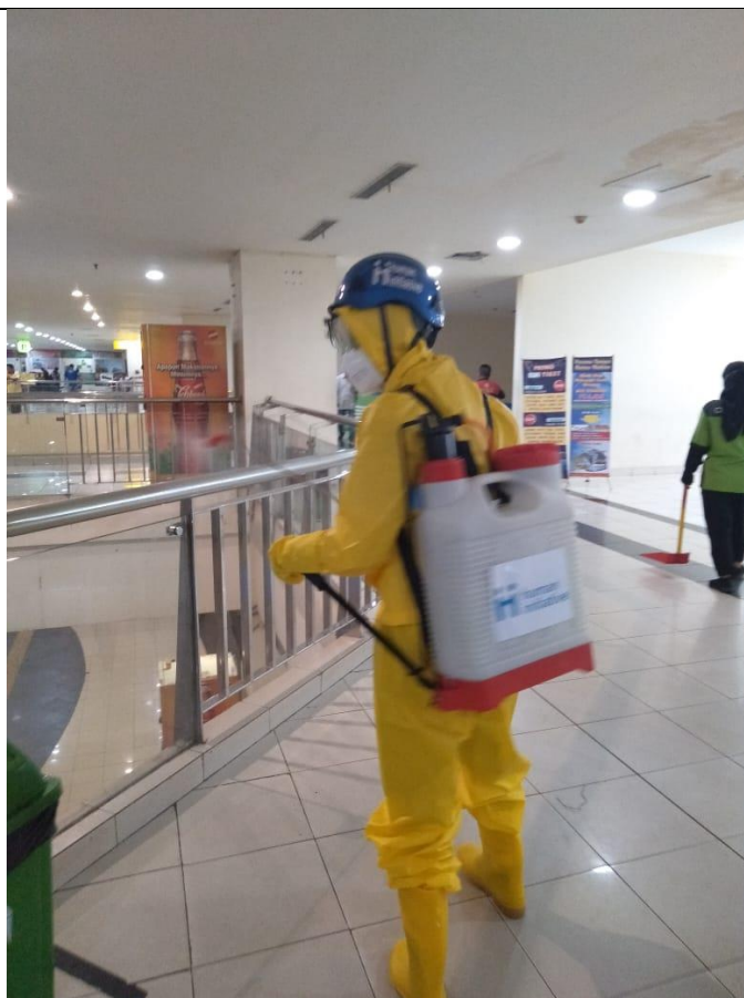
Disinfectant spraying at Pulo Gebang terminal in East Jakarta