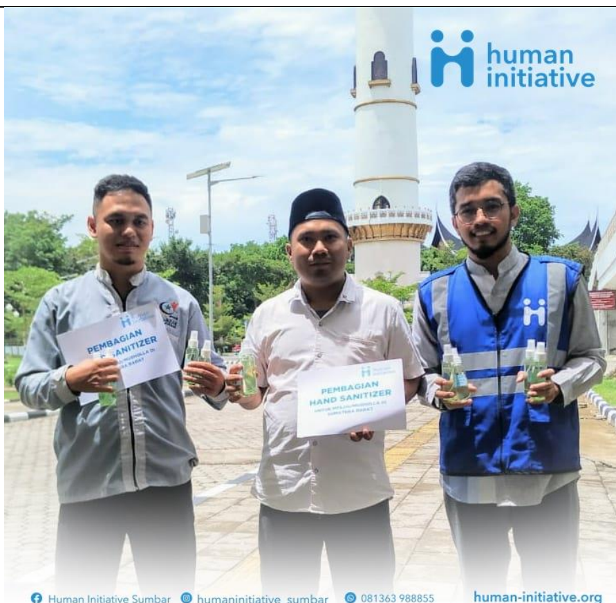
Hand sanitizer distribution in places of worship, West Sumatra