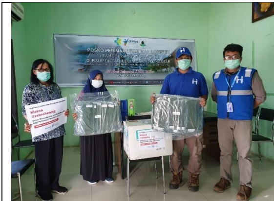
Distribution of PPE in RSUD Tadjudin Chalid, Makassar