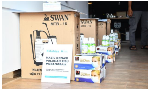
Distribution of Disinfectan Equipment