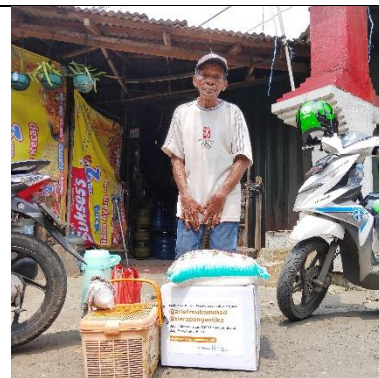
Distribution of Food Packages for street "coffee" vendors