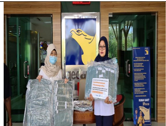
Distribution of PPE in RS BP Batam