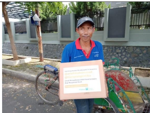
Distribution of Food Packages for Tukang Becak