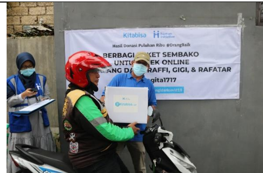
Distribution of Food Packages for online taxibike driver